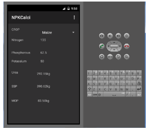
Fig. 4. Screen shot of Nutrient Recommendation

AgroNutri is an android application that provides its user with the crop specific nutrient requirement and amount of fertilizer to be applied. AgroNutri features an inbuilt database of major crops cultivated across the country. The user starts interacting with the AgroNutri by selecting the crop name for which the blanket recommendation ratio of major nutrients like Nitrogen, Potassium and Phosphorus for the selected crop is displayed. This ratio of Nitrogen,