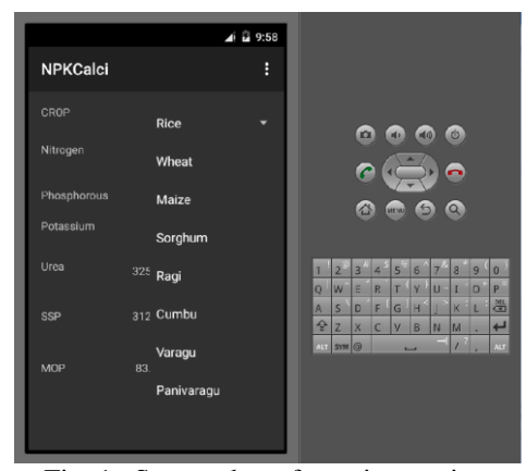
Fig. 1. Screen shot of user interaction

AgroNutri app was implemented using android operating system with KitKat as target version and Froyo 2.2 as minimum operating system requirement.